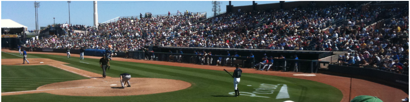
Figure 1: This is a teaser

The Kumquat Consortium jpkumquat@consortium.net